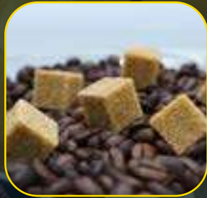
Herbal Teas & Coffee Cubes