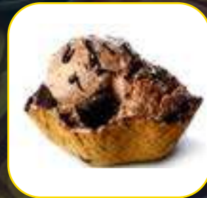
Ice cream Premixes